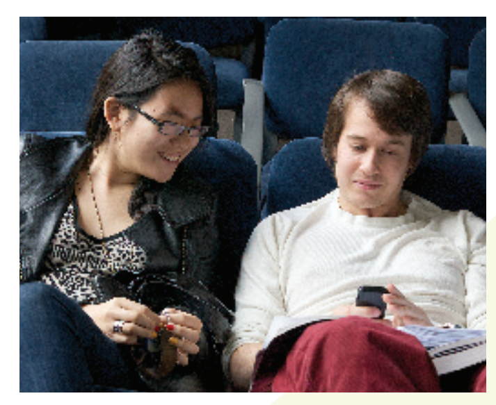
'The JCR is a place that I always drop into, because I know I'll find a friendly face.'

'Peter's has a reputation for having one of the most friendly and welcoming JCR's in Oxford. The JCR itself is a spacious, comfortable area to relax in, with vending machines, table football and table tennis, and a 55 inch HD screen – perfect for big sports nights. The JCR committee (elected by the student body) puts on a range of events including poetry nights, pub quizzes, BBQs, garden parties, film nights, hog roasts and an annual arts festival. There are regular themed College parties - known as 'bops' featuring extraordinary attempts at fancy dress. These take place in the JCR and the College Bar, which is one of the few entirely student-run bars in Oxford, providing excellent value as a result.' JCR President